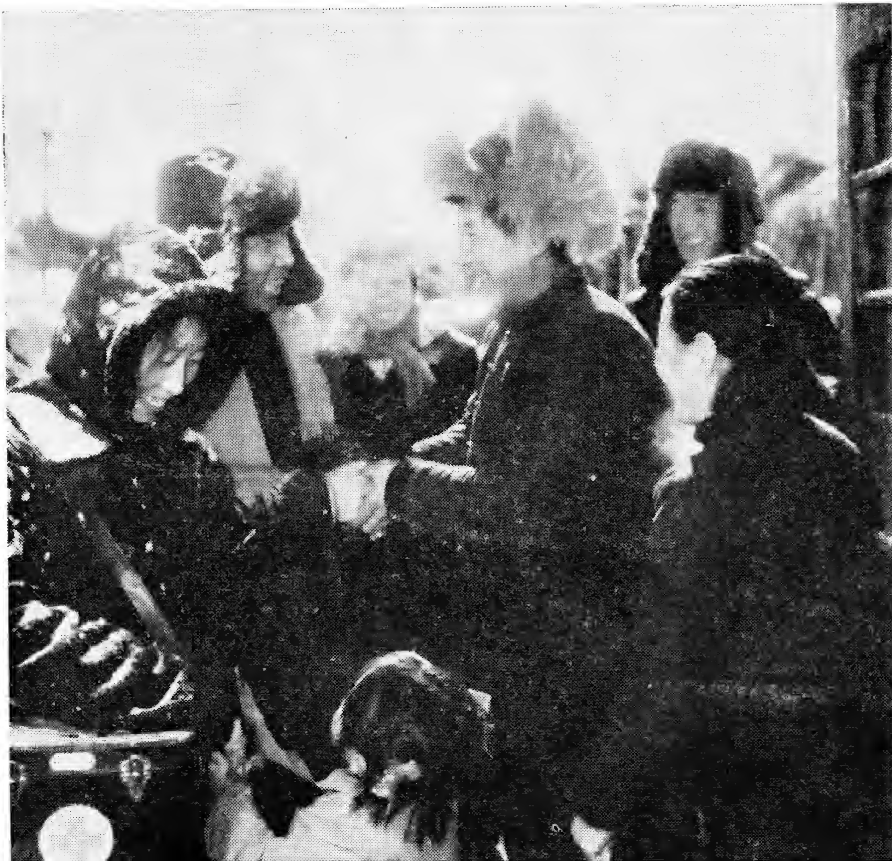
Peasants welcome a mobile medical team sent out by the Weitsin commune hospital, Kirin province.